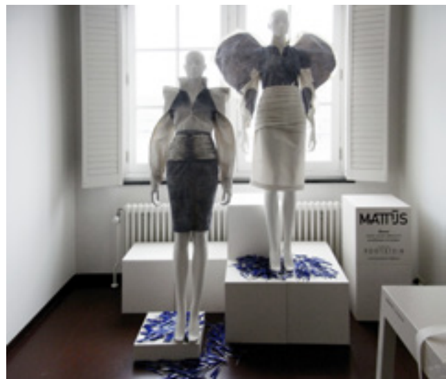
MATTIJS VAN BERGEN Fall/Winter 2009–2010 Collection. Patterns created using the BIC M10 ballpoint pen.